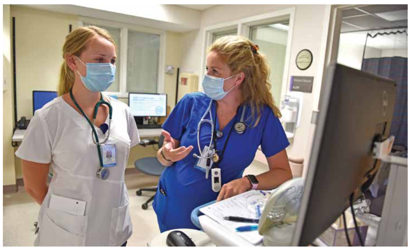
A nurse intern program at Lawrence + Memorial Hospital helped prepare the next generation of caregivers.