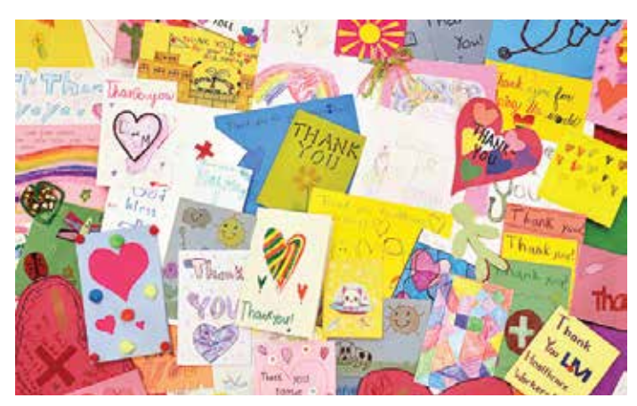
The community showered employees with thank you cards.