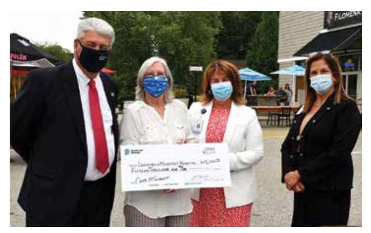
During the pandemic, the L+M Development Office accepted a generous donation