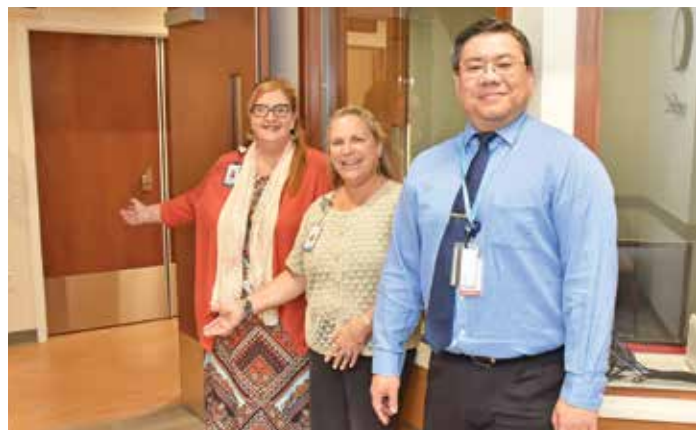
In the fall of 2019, Lawrence + Memorial opened a neurodiagnostic suite to better serve patients.

For the first time, Lawrence + Memorial Hospital earned a Press Ganey award for achieving and sustaining excellence in patient experience. The Guardian of Excellence Award® recognizes the achievements of the Acute Inpatient Rehabilitation Unit in achieving the 95th percentile or above for performance in Patient Experience. The award honors organizations who consistently sustained performance in the top five percent of all Press Ganey clients for each reporting period during the course of one year. The inpatient rehab team embraces an interdisciplinary approach that involves physicians, nurses, physical therapists, occupational therapists, recreational therapists, speech-language pathologists, dieticians, social workers and patient care assistants working together for the good of each patient.