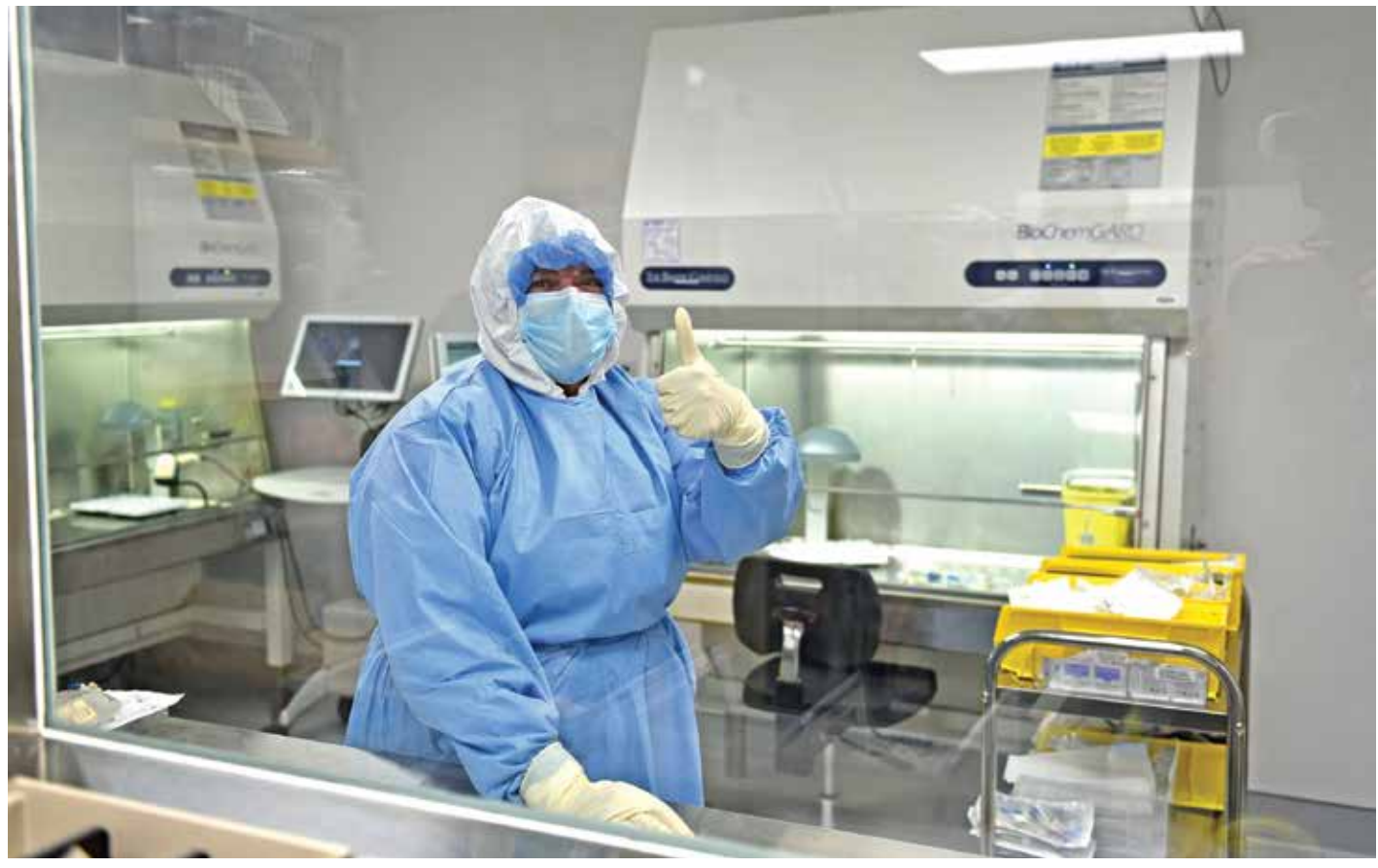
A $4 million pharmacy at Westerly Hospital opened with state-of-the-art equipment.

In the midst of the pandemic, Westerly Hospital unveiled a $4 million pharmacy in a new location, boasting state-of-the-art technologies. The pharmacy houses a computerized carousel that dispenses medications by bar code and automatically reorders supplies, a negative-pressure hood for safe preparation of chemotherapy medications and a "non-hazardous clean room" to ensure sterility during preparation of IV medications. The investment demonstrates the continuing commitment of Yale New Haven Health to invest in the community and enhance patient care.