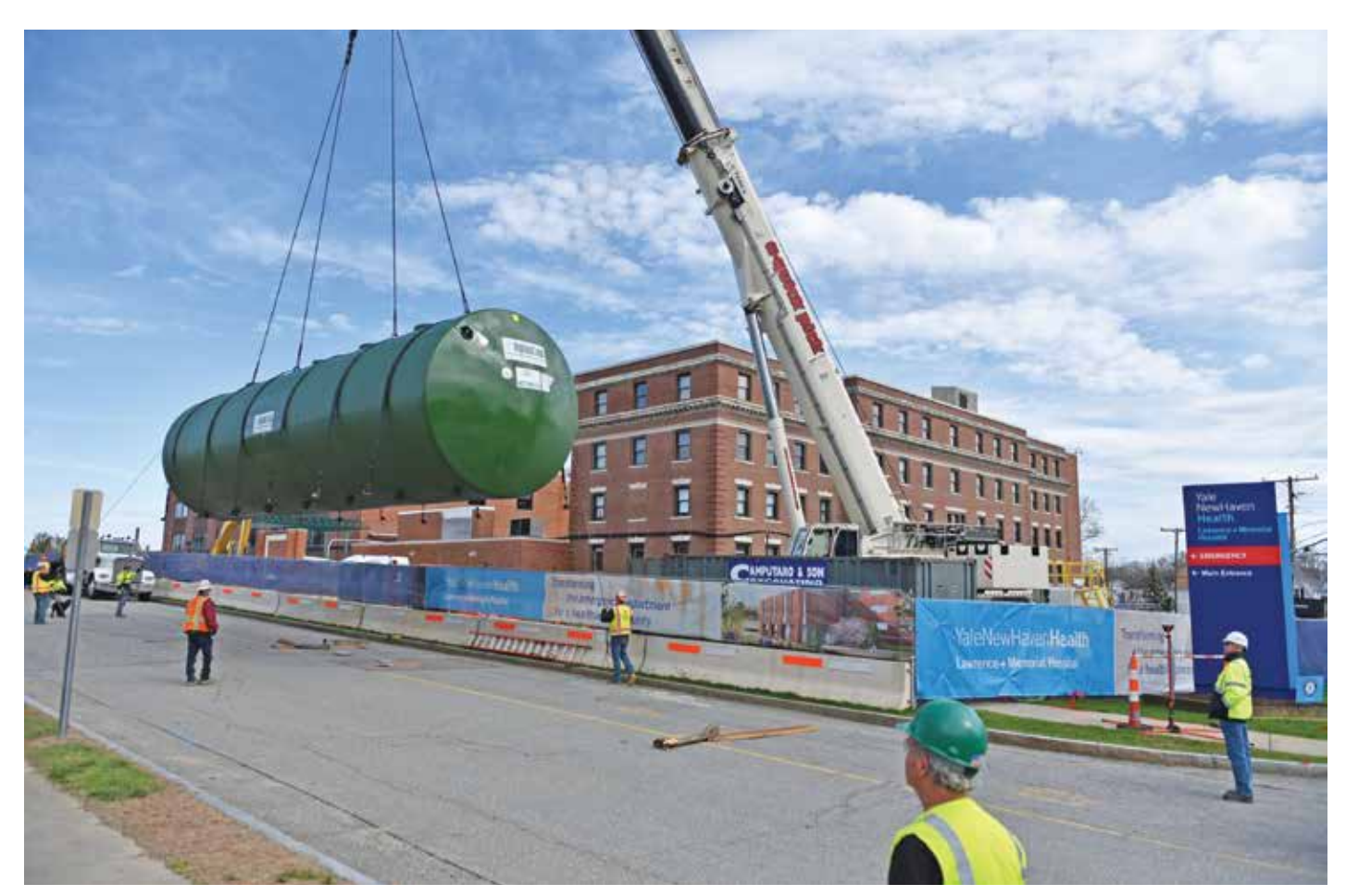
A new fuel tank arrived at Lawrence + Memorial Hospital as part of the Emergency Department renovation.

When completed, the full renovation of the Emergency Department will provide more comfort, privacy and clinical flexibility for patients and caregivers. Upon completion, the ED will include all private exam rooms, new patient waiting and triage areas and enhanced clinical stations that will facilitate staff workflow.