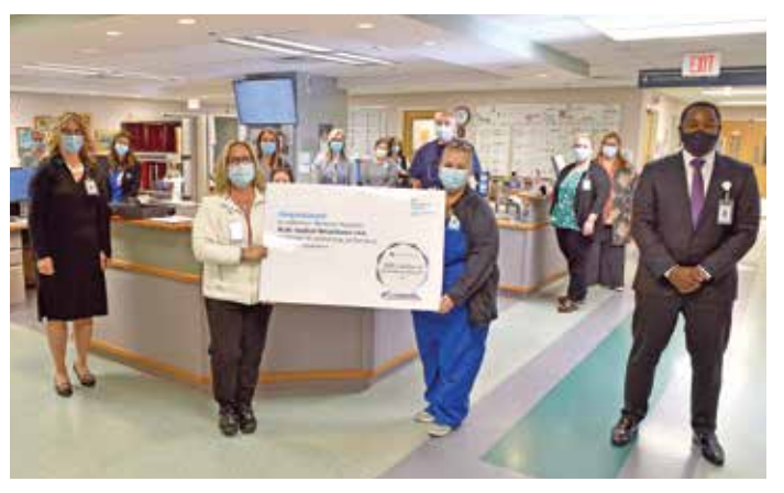
L+M's Acute Inpatient Rehabilitation Unit was named a 2020 Guardian of Excellence Award® winner by Press Ganey for achieving and sustaining excellence in patient experience.